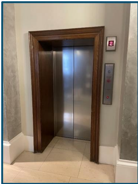
Photo: front hall lift- Ground floor level