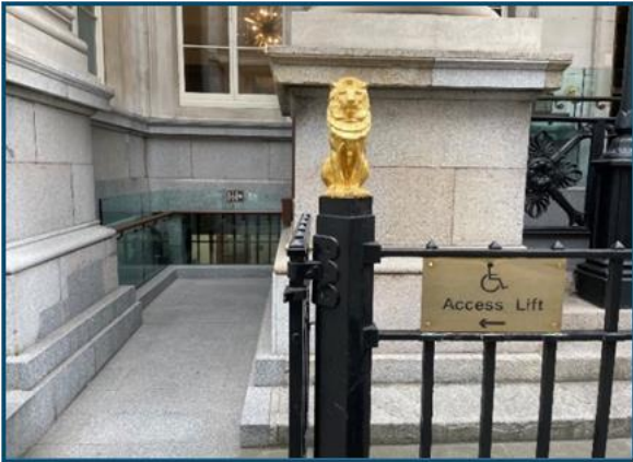
Entrance to accessible external lift from Chancery Lane road level