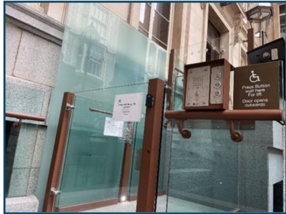
Accessible external lift