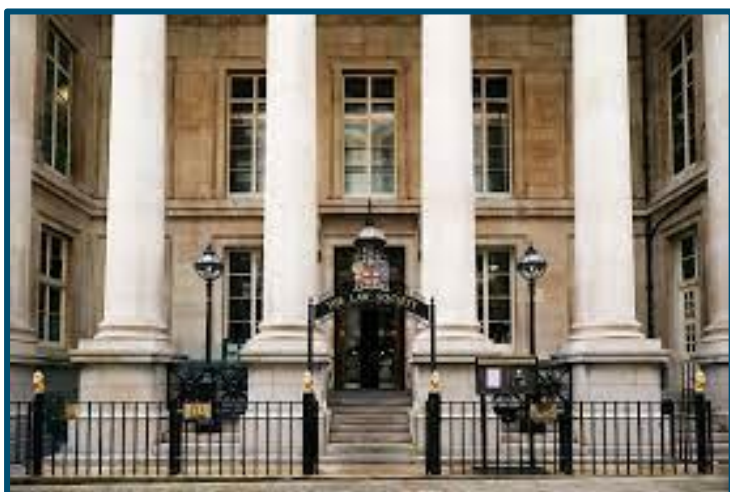
Photo: The Law Society, 113 Chancery Lane, London, WC2A 1PL, main visitor entrance

Enquiry line: +44 (0) 20 7242 1222 - available 9am-5pm Monday to Friday (excluding bank holidays)